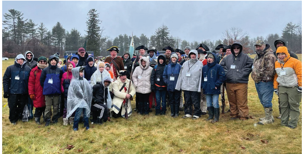
BSA Troop 27, Lawrenceville, with parents and reenactors

22nd Regiment of Foot 23rd Regiment of Foot, the Royal Welch Fusiliers in America 42nd Regiment of Foot, Grenadier Coy. 43rd Regiment of Foot Brigade of Guards, Grenadier Coy. Infanterie Regiment von Donop Von Prueschen's Feldjager Kompanie