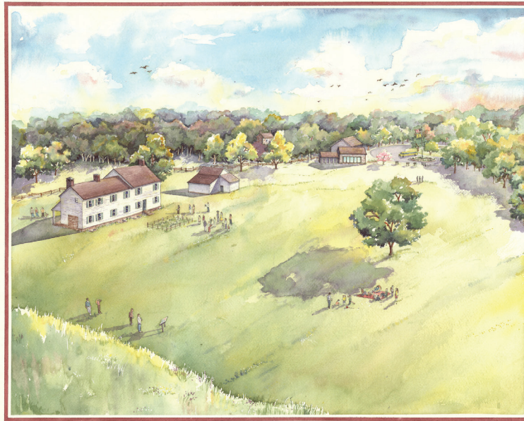
Vision of the Battlefield (Note location of a Visitor-Education Center)

Referred to as "Washington's Legacy," the plan will "lift a curtain on today's battlefield and transport visitors to the 1777 wartime landscape." Heritage tourists, visitors, and special event participants will have firsthand opportunities to explore and experience the January 3, 1777 battle, the