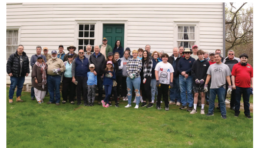
The Spring 2022 Clean Up Team