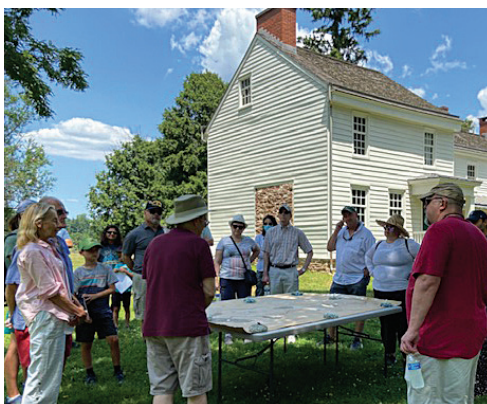
The days before the Battle of Princeton, known collectively as the Ten Crucial Days of 1776-77, are detailed during a tour to understand the battle on January 3, 1777

Spring Clean Up Day , on April 9, chaired by Mike Duffy, was another public service to the Park by a great team of volunteers. One surprise, during the removal of bamboo and evasive growth around the barn foundation, another structure was uncovered.