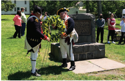
The memorial wreath at the Mercer Monument

Our commitment to historic education, commemoration, and the preservation of the battlefield continued over the past few months.