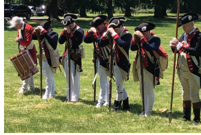
The 2nd PA's military ceremony