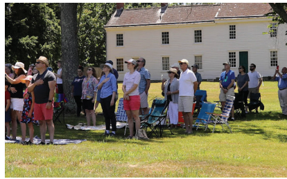
Some of the estimated 200 people who joined us in celebrating July 4